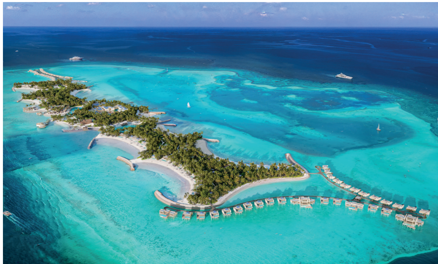
Mandarin Oriental, Maldives

The Delmore in Miami, designed in collaboration with Zaha Hadid Architects, marks its entry into the U.S. market, further expanding its international footprint. Through partnerships with world-renowned brands such as Versace Home, Roberto Cavalli, de GRISOGONO, and hospitality leaders, DAMAC consistently delivers exceptional living experiences and is known for setting new standards in design, architecture and craftsmanship.